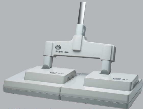
With the doppel, two standard Duo machines can be linked together to create a 70cm (28") machine

SEBO Clean Box contains 500gm of duo•P and is the ideal spot cleaner.