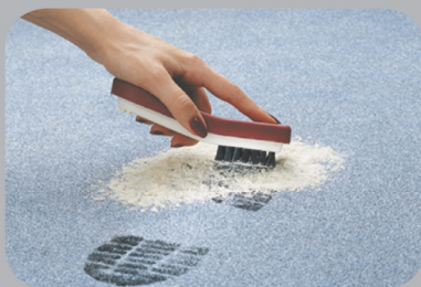
The lid of the duo•P powder box doubles as an easy to use brush