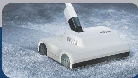
Effective brush action