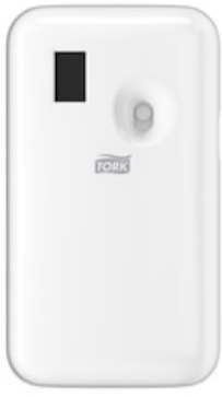
Tork Air Freshener Spray Dispenser White 562000