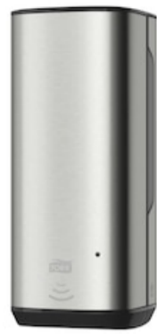
Tork Soap-Sanit Disp – Int Sens, SS 460009