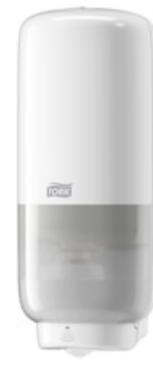
Tork Soap-Sanit Disp – Int Sens, wh 561600