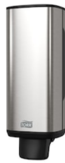
Tork Skincare Dispenser 460010