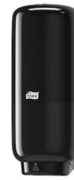
Tork Soap-Sanit Disp – Int Sens, bl 561608