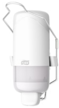
Tork liquid soap disp w bracket, White 560101