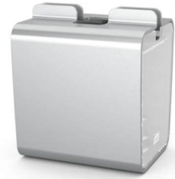
Tork XPN NapDisp, Aluminium (N4) 274002