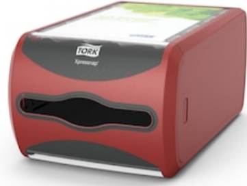
Tork XPN Counter NapDisp, Red (N4) 272512