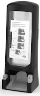
Tork XPN Drive Thru NapDisp, Black (N4) 272250