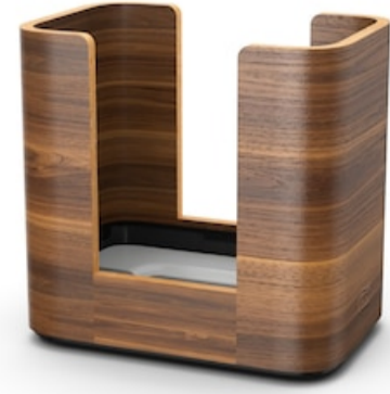
Tork XPN NapDisp, Walnut (N4) 273002